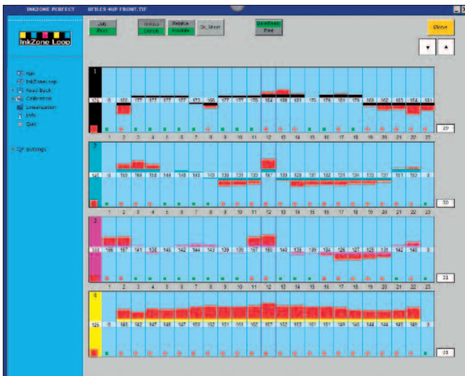
Input: See all ink values in all zones at a glance.