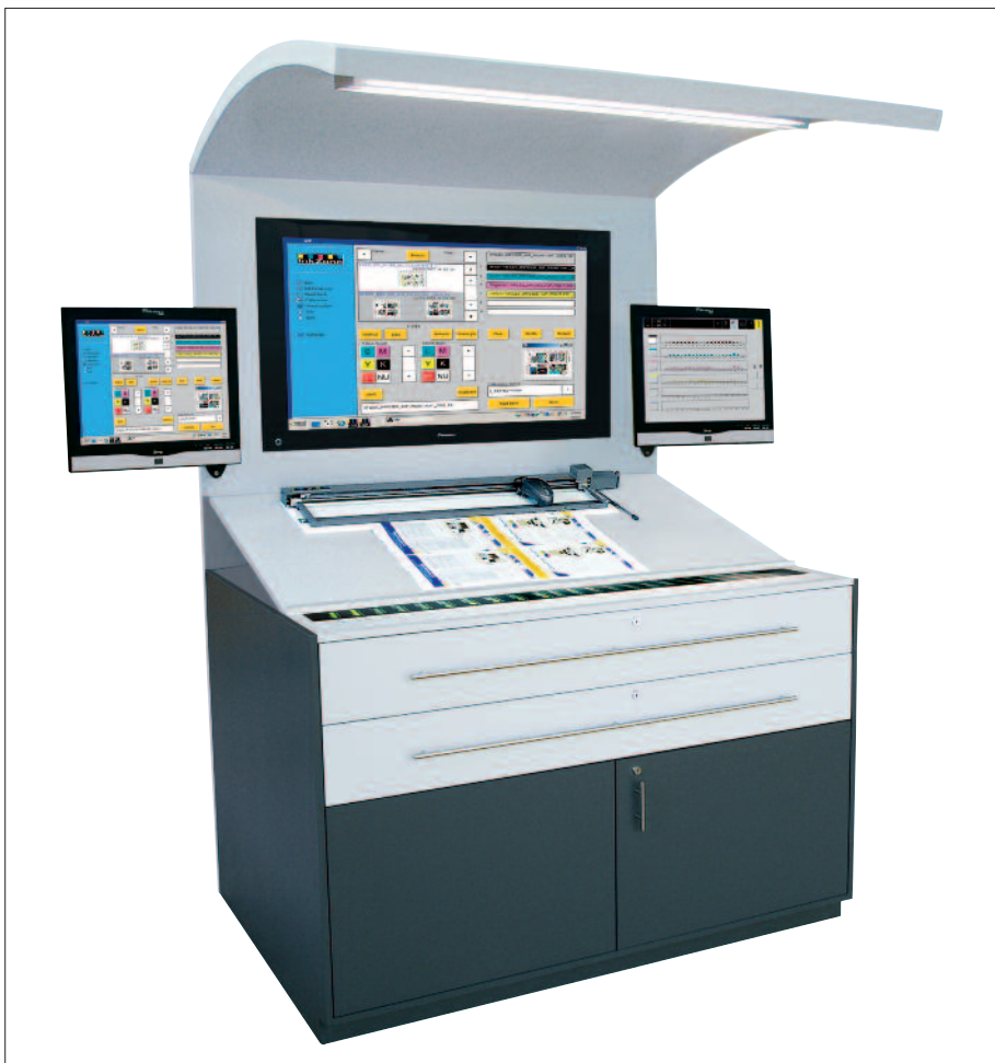
InkZone Loop is compatible with almost all press consoles.

So, once the operator checks the color results and the recommended press adjustments, at the touch of a button the ink keys for all printing units can be adjusted automatically. This can lead to results that are clear: a significant reduction in makeready and run waste, higher overall color quality, and consistent, stable production runs.